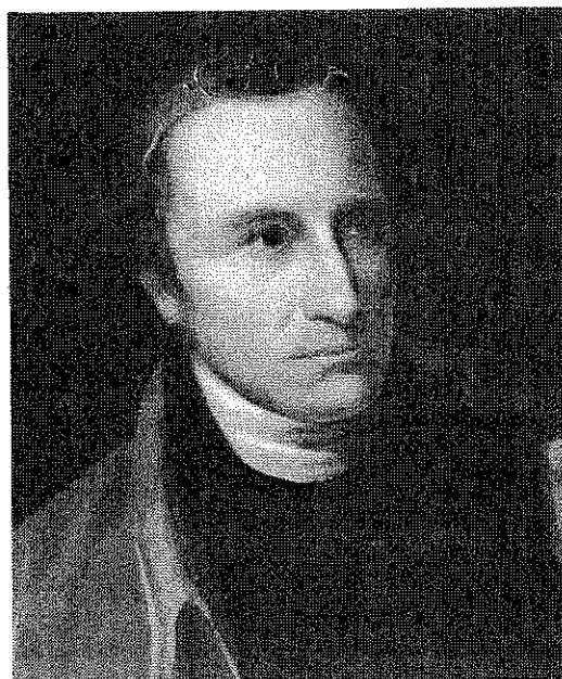
Patrick Henry (1736–1799)

Why did the Anti-Federalists demand a bill of rights?