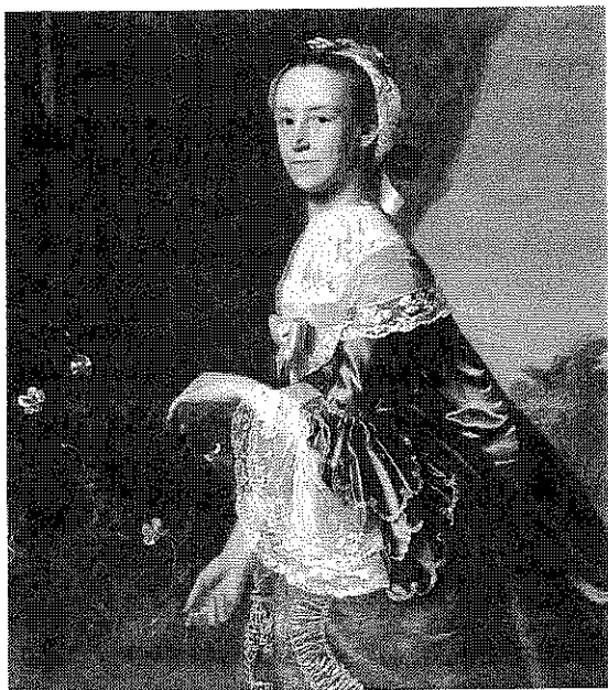
Mercy Otis Warren (1728–1814)

Warren and the other Anti-Federalists feared that, because of these flaws in the Constitution, the new national government would be a threat to their natural rights. They also thought that the Constitution had been developed by an elite and privileged group to create a national government for the purpose of serving its own selfish interests. Warren and most of the Anti-Federalists thought that the only safe government was one that was